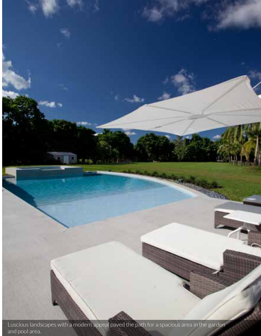
Luscious landscapes with a modern appeal paved the path for a spacious area in the garden and pool area.

Not only was the vision itself a challenging task, but so was the creation of the space, which became the first parameter for the design. Halfen added 2,500 square feet of space to an existing 3,000 square-foot home that required full renovation. In a way, it was as if she integrated two homes, while meticulously taking into account