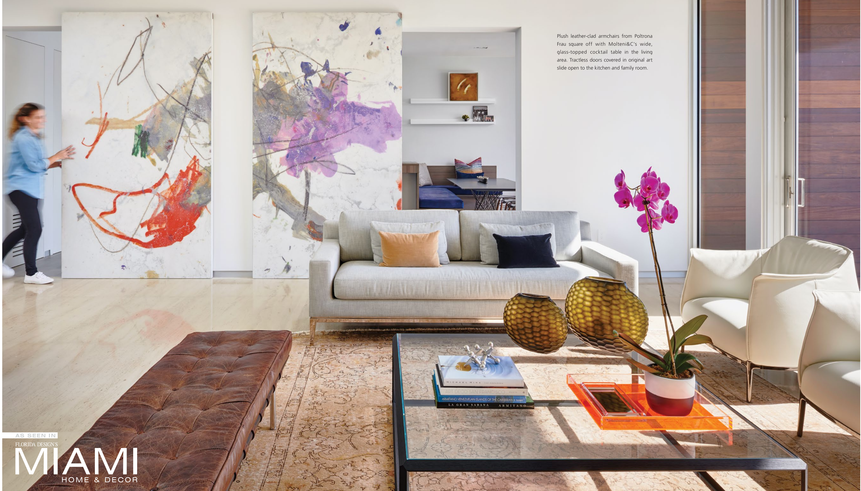
Plush leather-clad armchairs from Poltrona Frau square off with Molteni&C's wide, glass-topped cocktail table in the living area. Tractless doors covered in original art slide open to the kitchen and family room.

AS SEEN IN FLORIDA DESIGN'S MIAMI HOME & DECOR