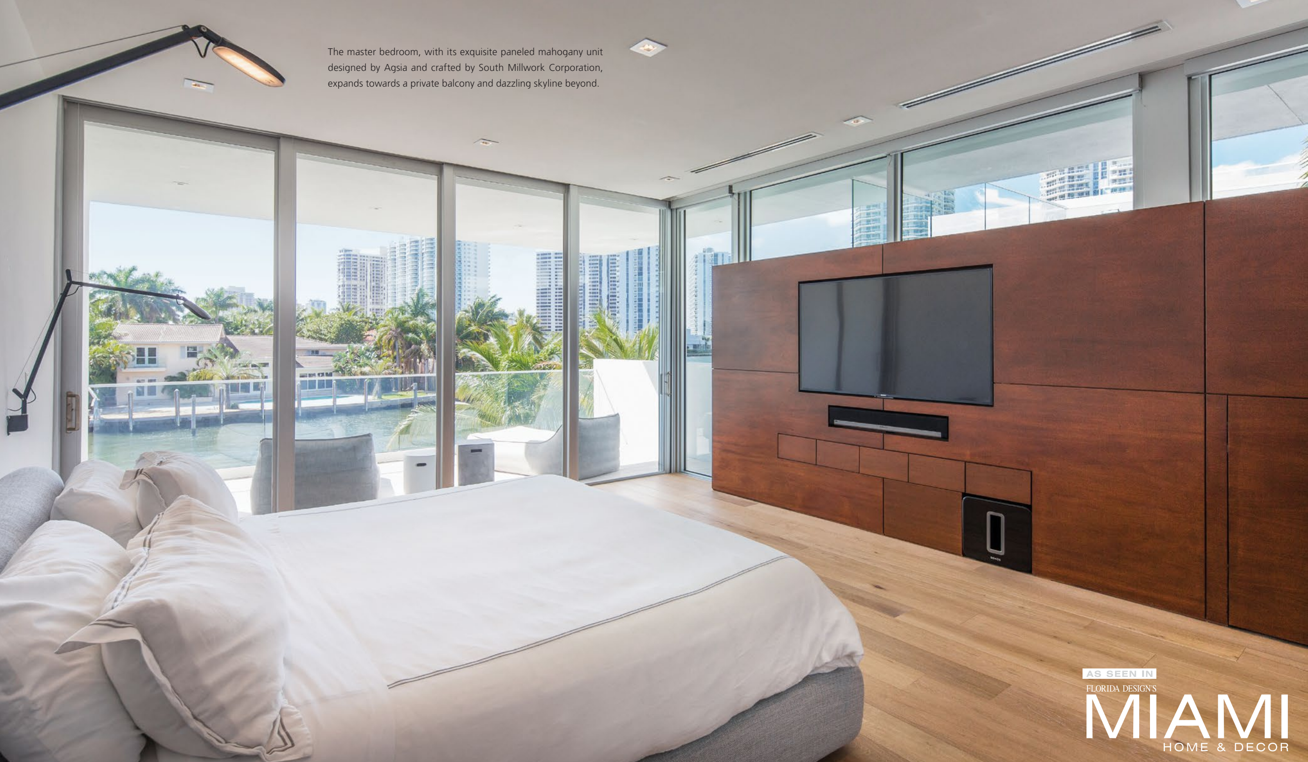
The master bedroom, with its exquisite paneled mahogany unit designed by Agsia and crafted by South Millwork Corporation, expands towards a private balcony and dazzling skyline beyond.

AS SEEN IN FLORIDA DESIGN'S MIAMI HOME & DECOR