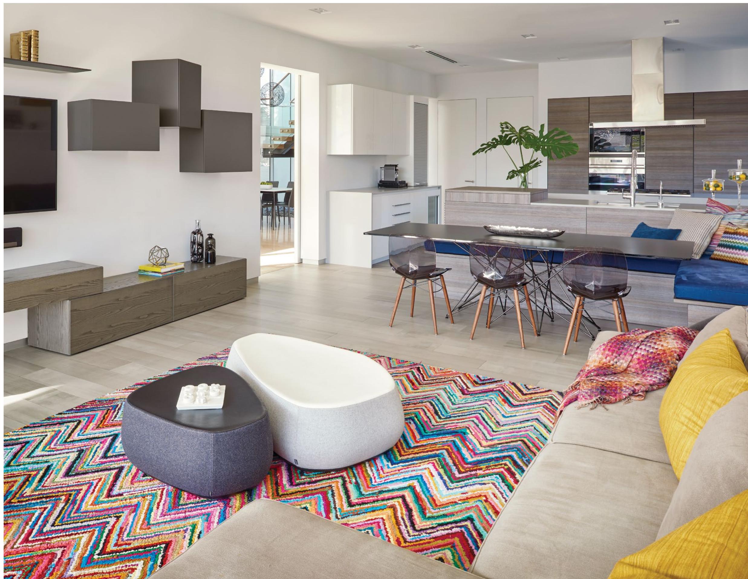
Geometry prevails in the cozy kitchen and family room, where Poggenpohl's cube cabinetry and banquette join Bonaldo's table and side chairs from Addison House. Nearby, cocktail modules by Moroso take center stage, while Missoni's theatrical throw and Surya's woven area rug add a burst of color.