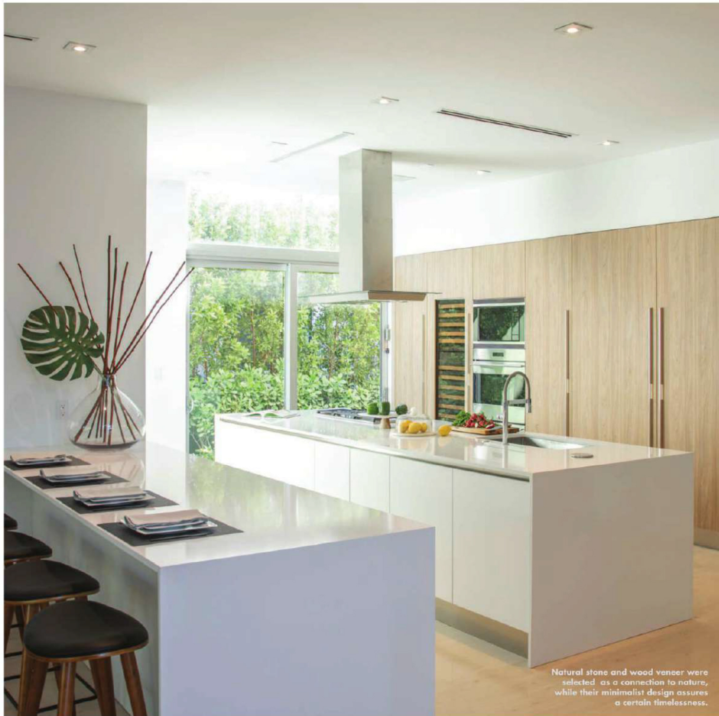
Natural stone and wood veneer were selected as a connection to nature, while their minimalist design assures a certain timelessness.

AS SOUTH FLORIDA CONTINUES its transformation, new houses are replacing older homes everywhere you look. This seems especially true in the South Florida's eastern neighborhoods, where new construction commands the highest prices. Whether building new in Fort Lauderdale's Harbor Beach or Miami's Bal Harbour, new construction often includes all the bells and whistles and doesn't feel it represents where we live. Not true with the single-family home designs by SDH Studio. When designing spec housing — single-family homes built for a developer, not a particular homeowner — this Miami-based firm digs deep to establish a dialogue between architectural form and the surrounding environment. Sometimes these connections are direct, sometimes more abstract. We recently spoke to the firm's principal, Stephanie Halfen about a recently completed design for a house in Bal Harbour.