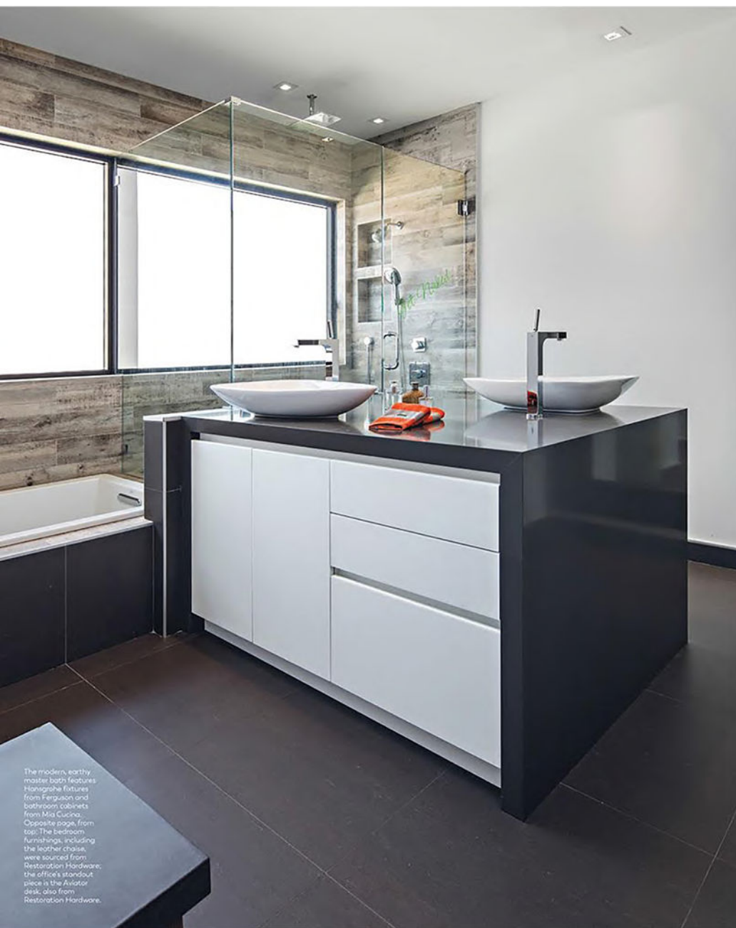
The modern, earthy master bath features Hansgrohe fixtures from Ferguson and bathroom cabinets from Mia Cucina. Opposite page, from top: The bedroom furnishings, including the leather chaise, were sourced from Restoration Hardware; the office's standout piece is the Aviator desk, also from Restoration Hardware.